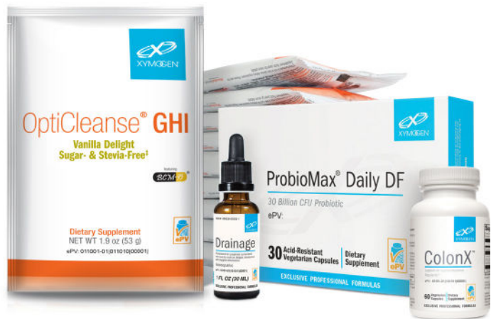
6 Day Detox Micro Kit includes 10 single serving packets of OptiCleanse GHI Vanilla Delight Sugar- & Stevia-Free † , 1 bottle of ColonX 60c, 1 carton of ProbioMax Daily DF 30c, and 1 bottle of Drainage 1 fl oz.