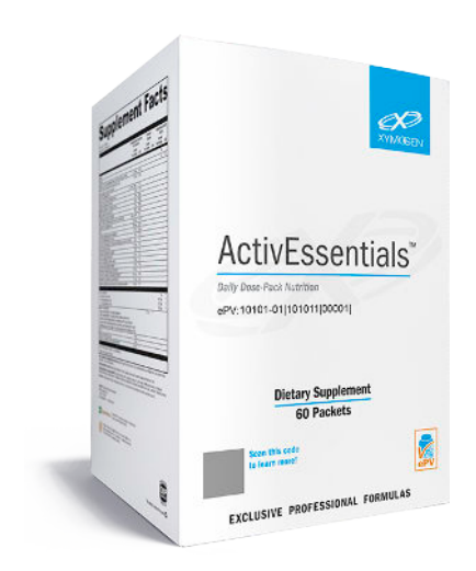
ActivEssentials is available in 60 packets ActivEssentials for Women is available in 60 packets ActivEssentials with Calcium is available in 60 packets