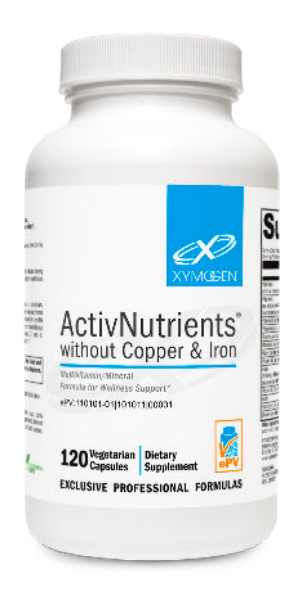
Available in 120 capsules