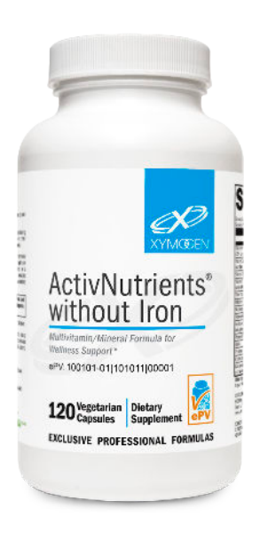
Available in 60 capsules, 120 capsules, and 240 capsules