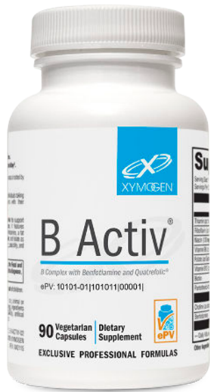
Available in 90 and 180 capsules