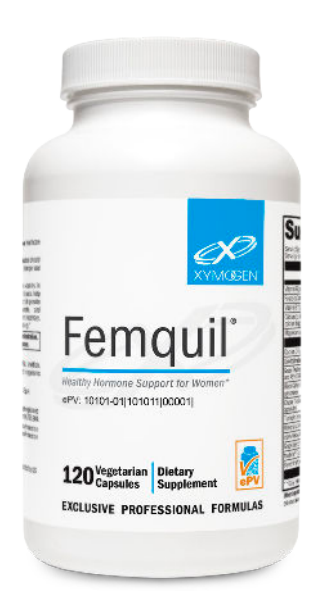
Available in 120 capsules