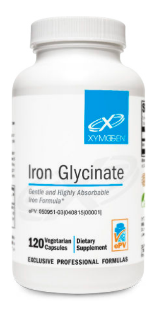
Available in 120 capsules