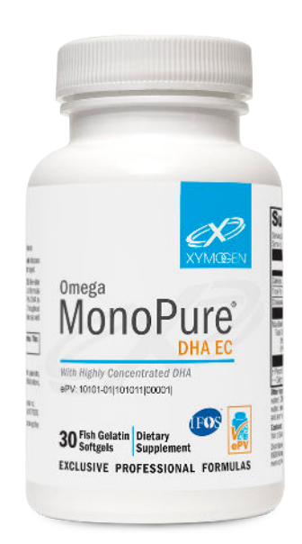
Available in 30 fish gelatin softgels