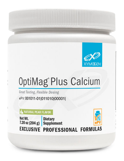
Available in Natural Pear