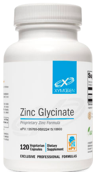
Available in 120 capsules