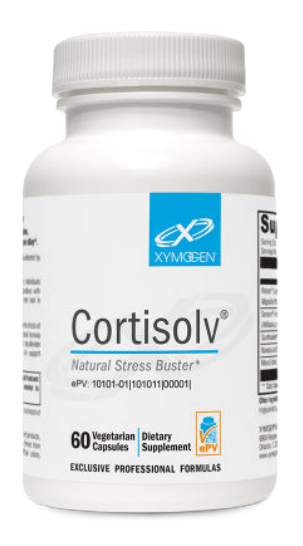
Available in 60 and 120 capsules